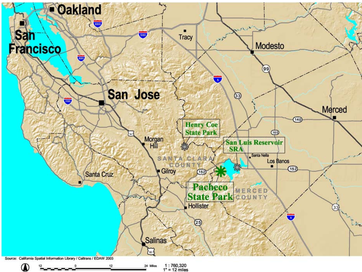
Map ES-1 Regional Map