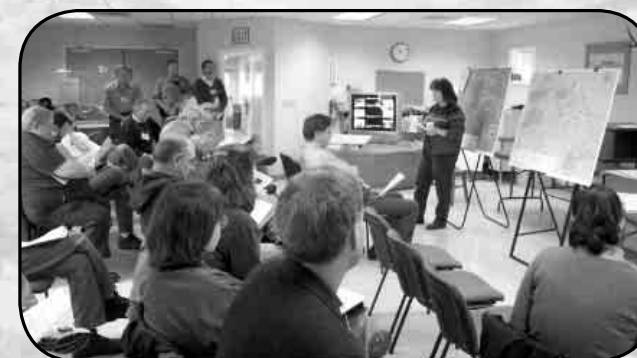
Public Planning Workshop #1

The first public planning workshop for the San Luis Reservoir General Plan/Resource Management Plan and Pacheco State Park General Plan was a success! Thanks to all who attended and shared their ideas about the parks' futures and also to those of you who filled out the survey. A summary of comments from the scoping meeting/workshop and the survey are enclosed. We're now in the process of incorporating your ideas into three alternatives for each Plan. These plans will define long-term visions for the parks, identify desired improvements and enhancements, and provide guidelines for protecting natural and cultural resources.