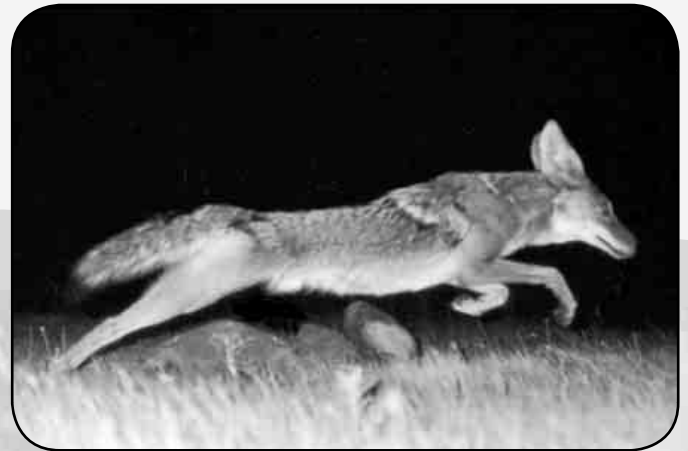
Biologists working on the San Luis Reservoir wildlife inventory photographed this coyote at night, using a stationary camera set with infrared transmitters.

The Los Baños Detention Dam lies approximately 10 miles to the southeast of San Luis Reservoir. The area contains camping and day use areas and also provides boating and fishing opportunities. Both the San Luis and Los Baños areas host many plant and animal species and associated habitats, including some that warrant special management considerations, such as the San Joaquin kit fox, a federal and state endangered species.