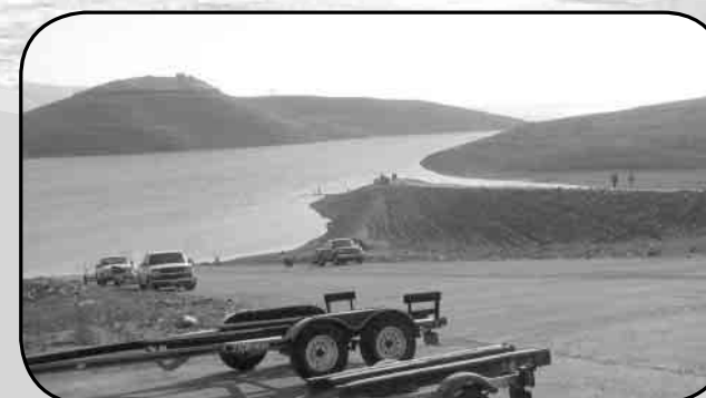
Dinosaur Point Boat Ramp

This meeting will be designed as an open house – so you can drop in any time during the session to learn about the alternatives and provide your comments. Presentations for the alternatives will be given at 90 minute intervals between 4:00 and 8:00 pm so you don't need to stay for the whole meeting to participate. Your attendance is important for reviewing the plans, so please join us!