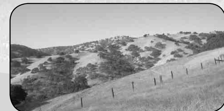
Summer Hills at Pacheco

If you are not currently on our mailing list and would like to receive the planning update and notice about future workshops, or wish to send written comments, please contact us at: