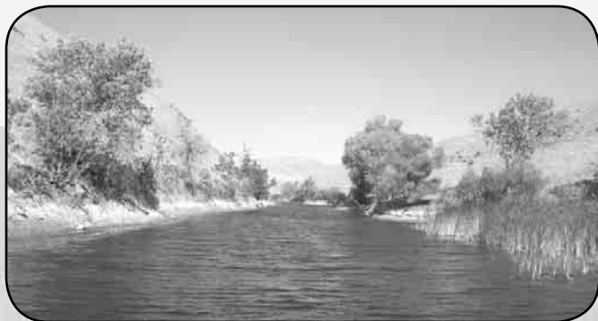
Los Baños Riparian Corridor

The San Luis Reservoir is well-known for its windsurfing, fishing, camping and boating opportunities, in addition to other recreational activities. Equally important in the planning process is the area's historic significance, including its early use by Native Americans and later as important lands in California's ranching history.