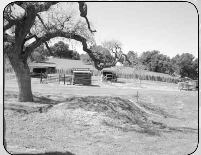
Historic corrals characterize the Fatjo ranch

This park is separate from San Luis Reservoir, and a General Plan has never been prepared for it before. The planning process will coordinate the work for these two areas while still recognizing their differences. The General Plan process will be an opportunity to plan for the future of the sites' historical and natural resources, while exploring ways to enhance recreational use of the property.