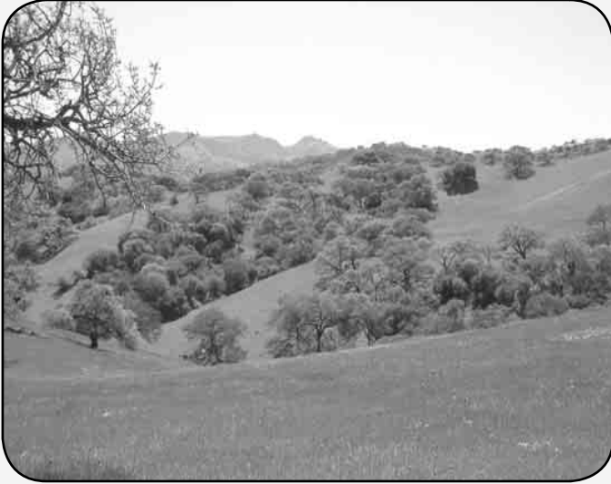
Scenic Rolling Hills of Pacheco State Park

The approximately 6,800 acres of Pacheco State Park were donated to the State of California by the late Paula Fatjo, a descendant of Francisco Pacheco. Currently, 2,600 acres are open to the public, principally for hiking and horseback riding. These lands were part of the larger 48,000-acre Mexican land grant deeded to Pacheco in 1843. The original adobe structure built by the Pacheco family was moved during the construction of the San Luis Reservoir and sits amidst the other ranch buildings, paddocks and outbuildings that exist today. The park is adjacent to the San Luis Reservoir on the east and is accessible off Dinosaur Point Road from State Route 152 in western Merced County.